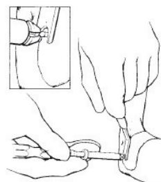
Figure 7: Inserting the LeadFIX-membrane pins.