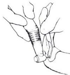
Figure 6: Use the drilling and positioning guide on hard membranes.