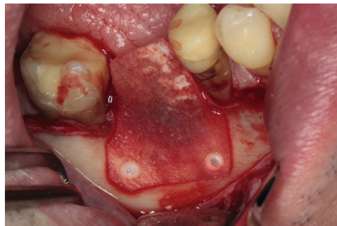
Figure 1: LeadFix Pin in use during dental surgery.

MATERIAL. The membrane pin comprises osteosynthetic implant material and has proved to be an effective suture material. Biological degradation occurs through hydrolysis to lactic acid, which is subsequently metabolised to CO 2 and H 2 O.