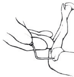
Figure 5: Use the probe with soft membranes.