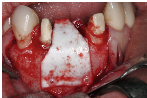
Figure 2: Fixation of a membrane with degradable pins.